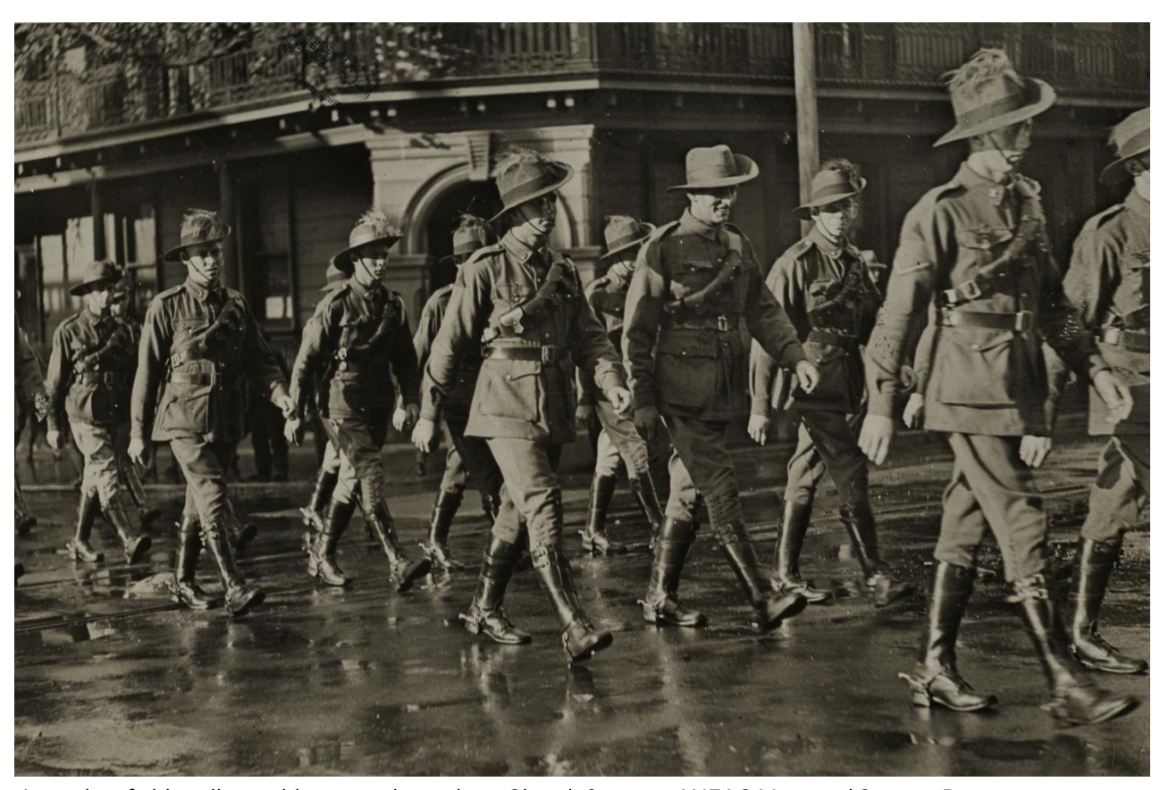
Australian field artillery soldiers marching along Church Street to ANZAC Memorial Service, Parramatta, ca. 1920s - 1930s City of Parramatta Local Studies Library: <u>LSP00533</u>.

Prepared by Research and Collection Services, City of Parramatta Council