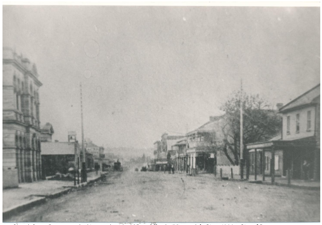
Church Street Parramatta looking north with old Post Office building on left. Circa 1880s.

Prepared by Research and Collection Services, City of Parramatta Council Transcriptions by DigiVol online volunteers 2022